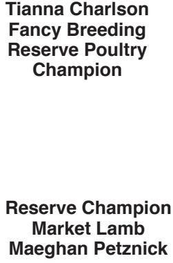
Reserve Champion Market Lamb Maeghan Petznick